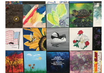
Some of the squares you’ll see

As soon as the current exhibit ends, we will begin the setup for our Holiday Gift Gallery. The Holiday Gift Gallery runs from November 22nd through December 22nd. Hours will be announced before the show starts. A great way to get that one-of-a-kind gift and support the arts in Dodge County.